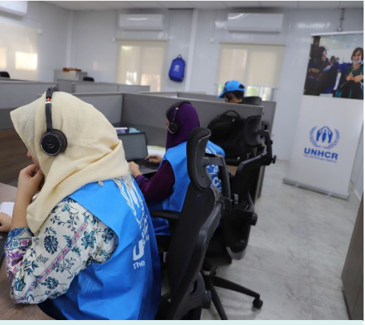
UNHCR helplines have been inundated, with a 65% increase in calls in recent weeks.